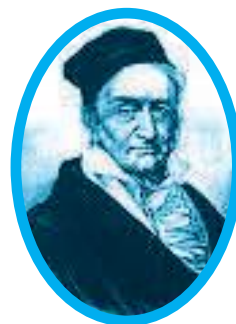
Carl Friedrich Gauss (1777 – 1855)

Carl Friedrich Gauss is often referred to as the 'Prince of Mathematicians' and is considered one of the three greatest mathematicians of all time, along with Archimedes and Newton. He has made fundamental contributions to both mathematics and science.