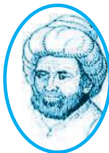
Muhammad ibn Musa al-Khwarizmi (C.E. 780 – 850)

A lemma is a proven statement used for proving another statement.